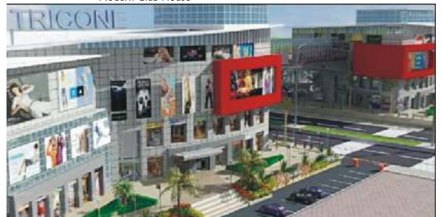
Shopping & Retail Complex