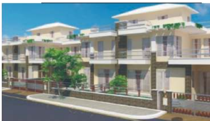
State-of-the-art Housing Complex