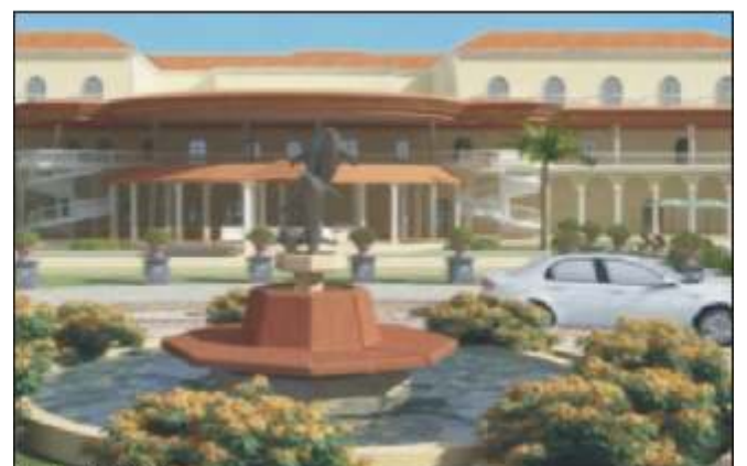
Modern Club House