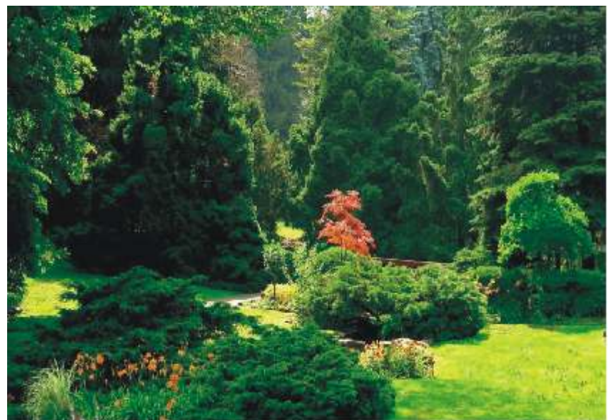
Lush Green Environs